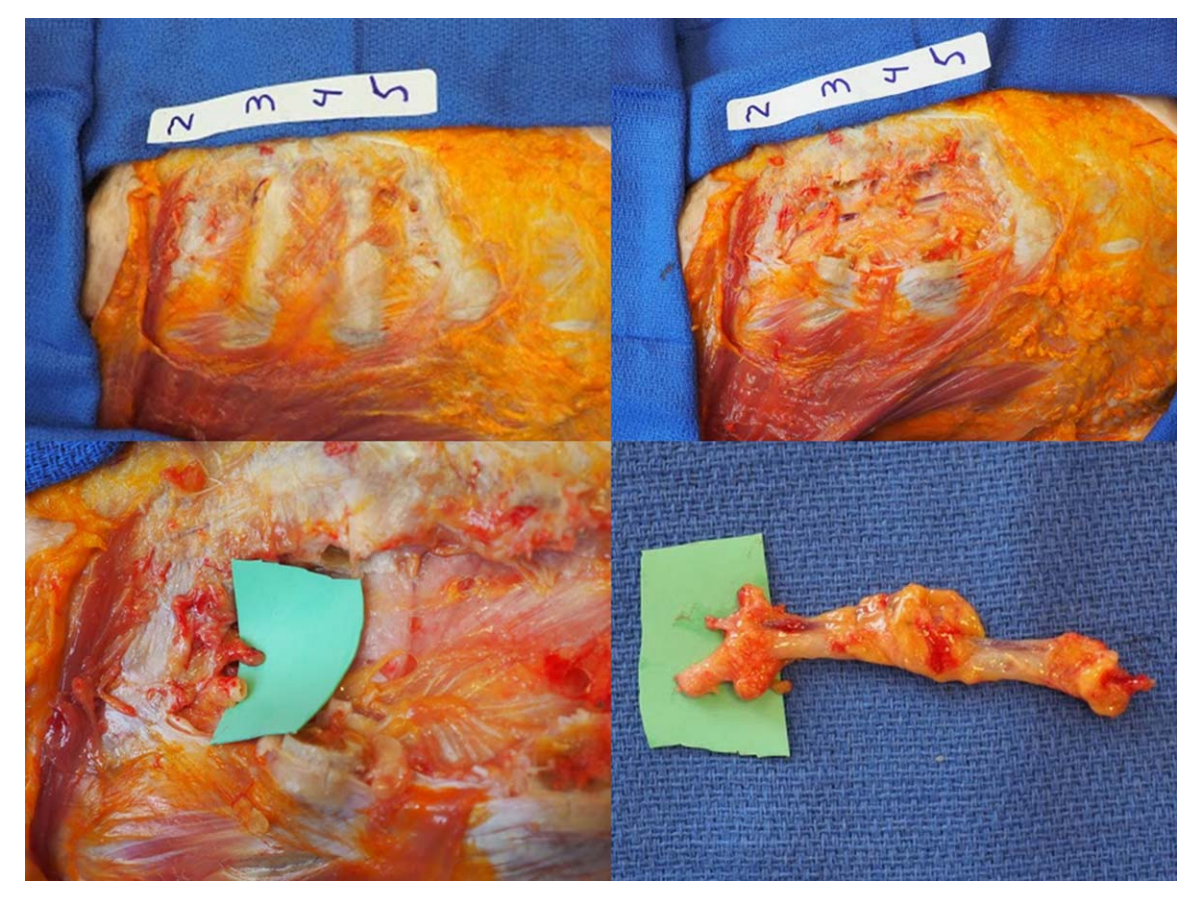
Figure 1. Cadaveric dissection of internal mammary lymph node flap showing removal of the pectoralis major (top left), dissection of the internal mammary vessels and adjacent lymph nodes (top right), 8 mm residual stump of internal mammary artery and vein after flap harvest (bottom left), and harvested internal mammary lymph node flap (bottom right). [Color figure can be viewed in the online issue, which is available at wileyonlinelibrary.com.]

obtained from an approved vendor (ScienceCare, Denver CO). All cadaveric specimens were females and had no history of surgery on the neck, breast, chest wall, or axilla. Cadavers ranged in age from 70 to 90.